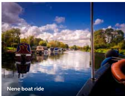
Nene boat ride