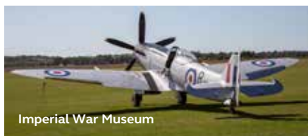
Imperial War Museum

Don't forget to check your Great Saving Guide for all the latest offers on attractions throughout the UK. camc.com/greatsavingsguide