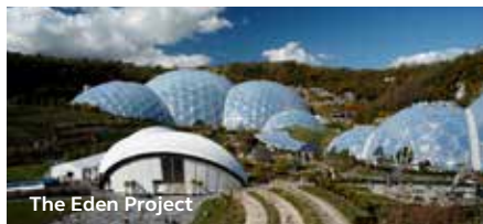
The Eden Project

Don't forget to check your Great Saving Guide for all the latest offers on attractions throughout the UK.