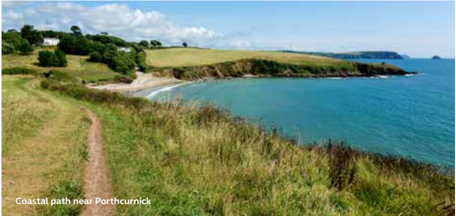
Coastal path near Porthcurnick

Enjoy walking along the coastal footpaths and beaches; from site, follow the stunning path to St Anthony Head. For a range of walking routes on the peninsula visit www.falriver.co.uk/walks .