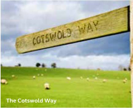
The Cotswold Way