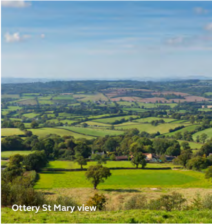
Ottery St Mary view