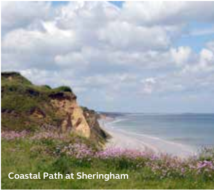
Coastal Path at Sheringham