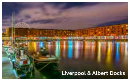
Liverpool & Albert Docks